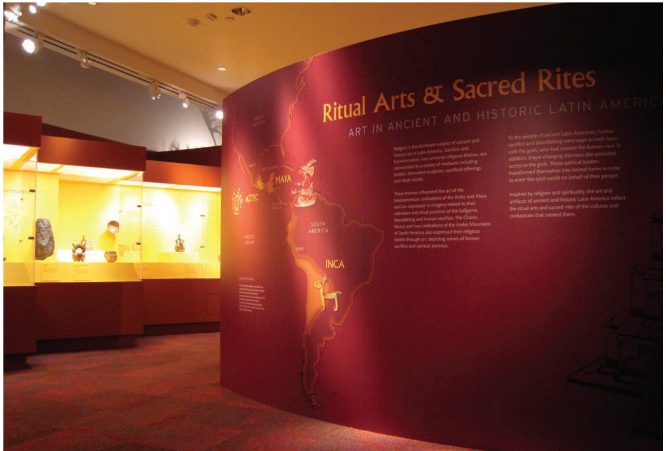
A curved introduction wall slowed the visitors pace and summed up the exhibit concept.