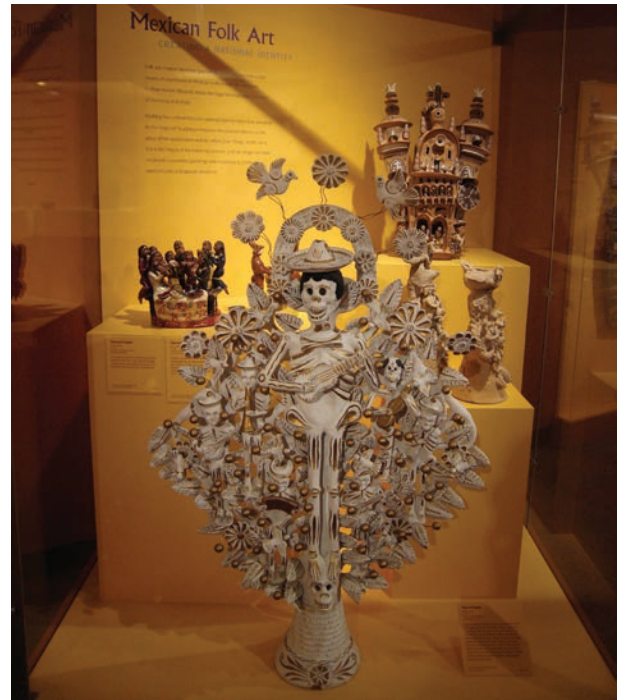
In addition to the ancient objects in the exhibit, several contemporary objects from Día de los Muertos celebrations were featured, showing a continuum of South American ritual art.